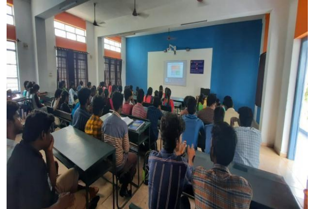
Students of ECE attending the Webinar