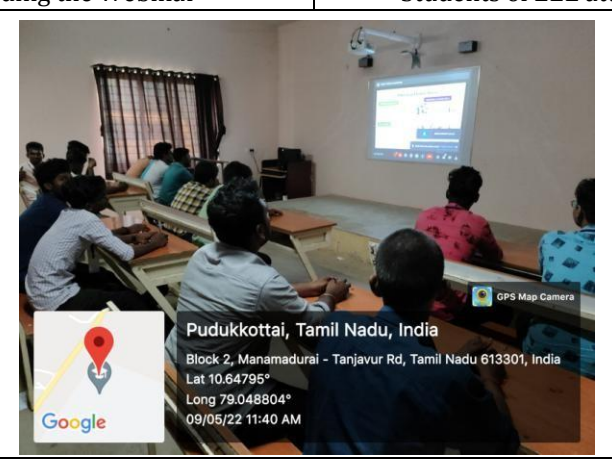
Students of MECH attending the Webinar \,